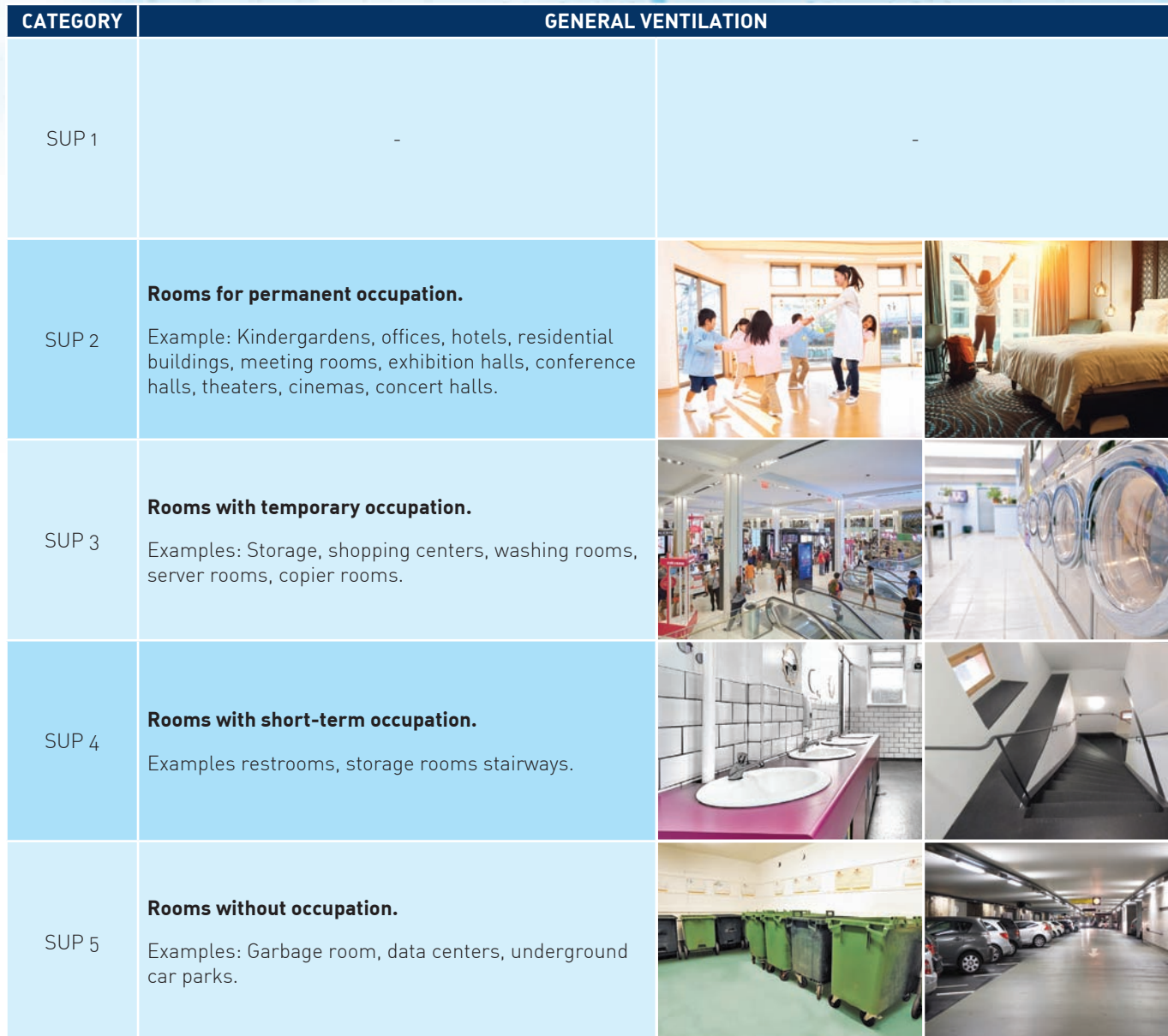
Table 4: General ventilation - indicative examples of application matched to corresponding SUP categories

Examples of typical applications corresponding to the respective SUP categories are shown in Table 4: