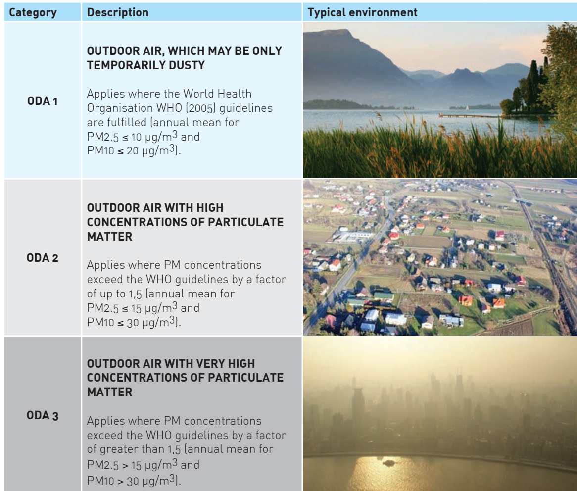
Table 1: Outdoor air categories