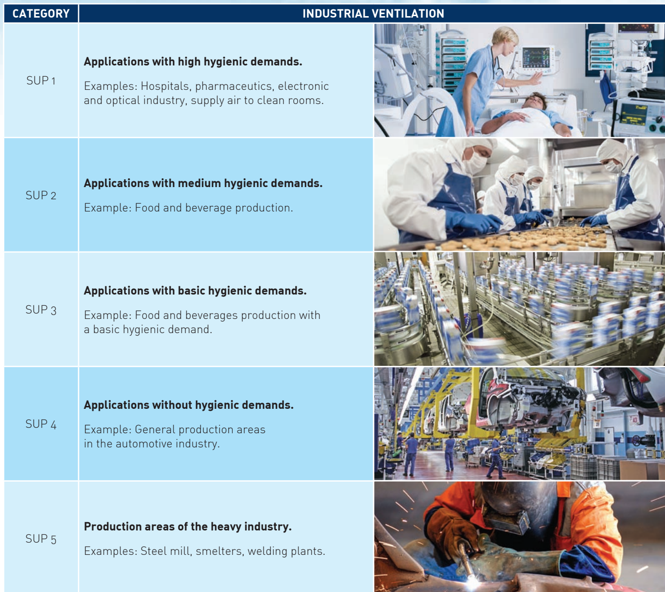
Table 4: Industrial ventilation - indicative examples of application matched to corresponding SUP categories